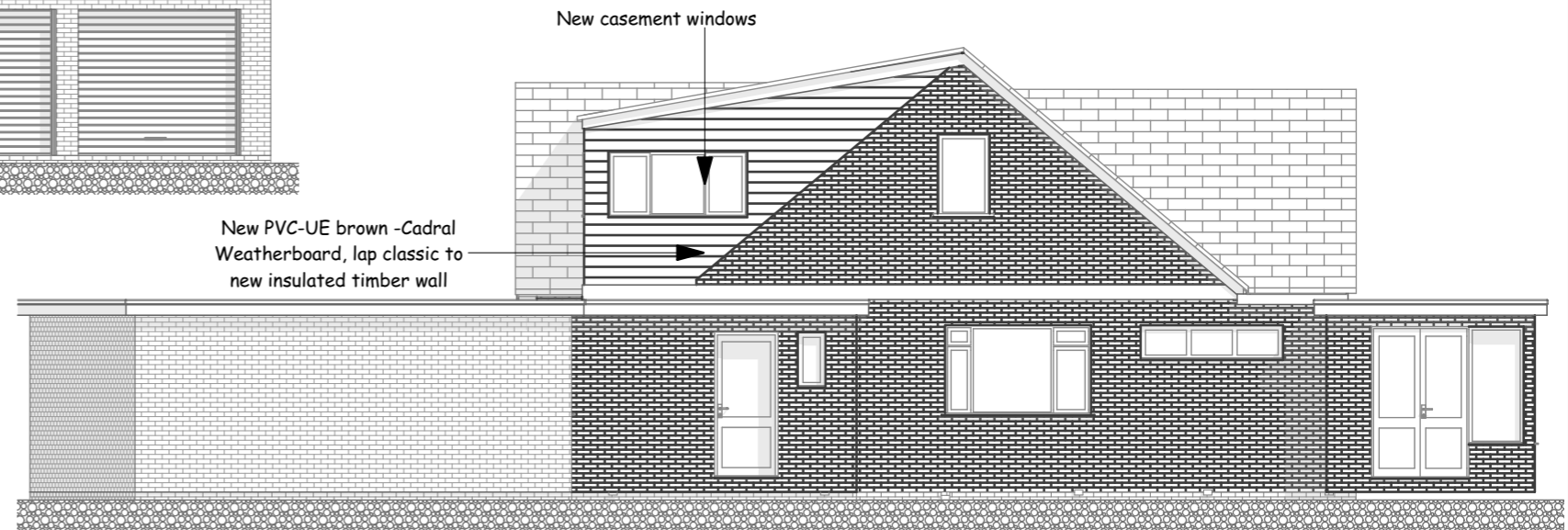
Proposed Right Elevation