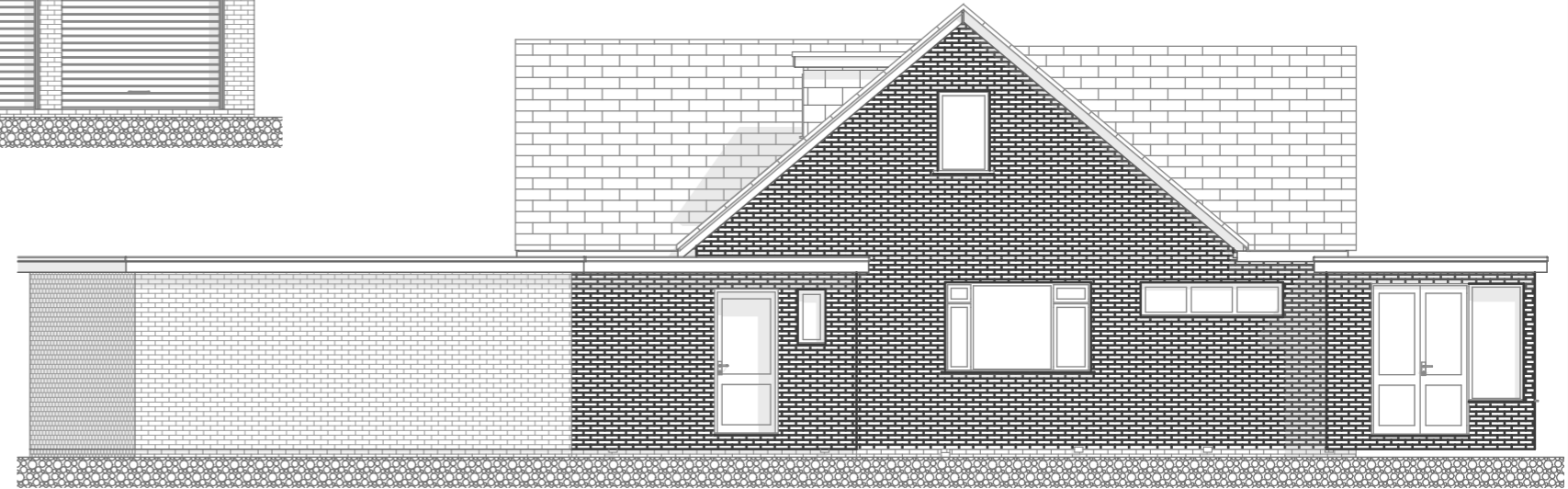
Existing Right Elevation